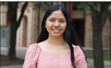
Isabel Morales / FOTO RIDER