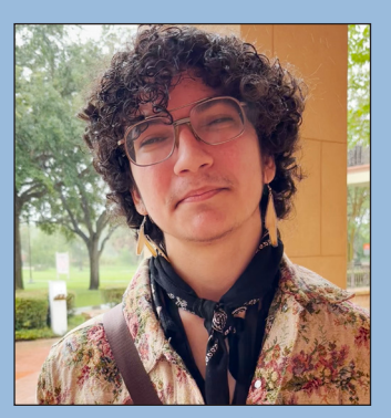
Seven Parrish art education junior "oversized blazer"