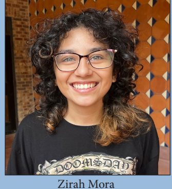
integrated health science freshman "sweaters, knitted sweaters"

--Compiled and photos by Silvana Villarreal