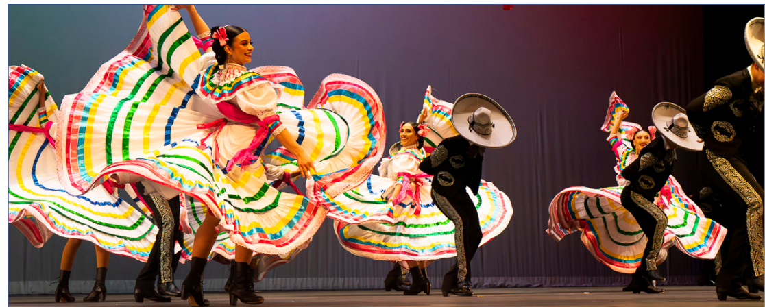
Members of the Ballet Folklórico at UTRGV dance in traditional folklórico costumes from the state of Jalisco, Mexico, during the performance of "Leyendas" Sept. 7 in the Performing Arts Complex on the Edinburg campus.