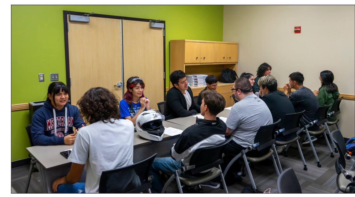
Team Victoriam, a club at UTRGV, brings back a classic approach to connecting with potential partners through speed dating on Thursday in the Student Union Sage Room on the Edinburg campus.