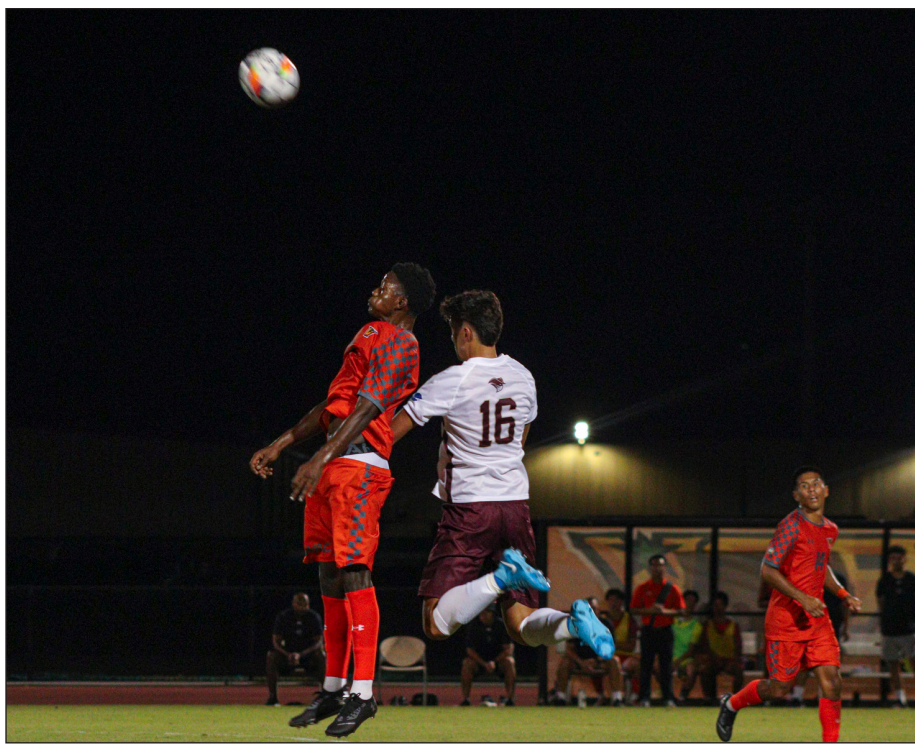
THE RIDER FILE PHOTO

The UTRGV Men's Soccer Team will return to Western Athletic Conference contention. Currently, it is one of only two UTRGV programs remaining in the WAC since the university announced its move to the Southland Conference