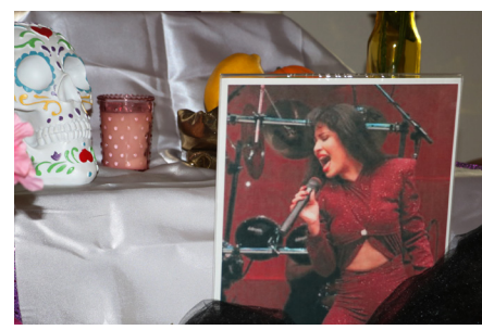
Para honrar su memoria en el Día de los Muertos, una foto de la cantante tejana Selena Quintanilla está en un altar fotografiado el 30 de octubre en el segundo piso de Sabal Hall en el campus de Brownsville